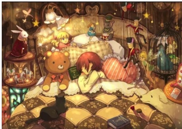
A reference picture of the girl and the dream worlds feel.

Each dream ends with the child confronting different monsters in the dream overcoming their fears they faced in reality in their dreams. After confronting a nightmare a door will appear that takes the player out from their dream and back into reality.